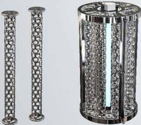
Hexagon Filter Tube