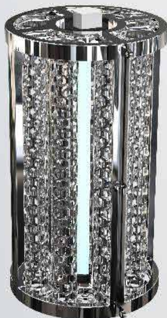
Hextio Reactor Cell